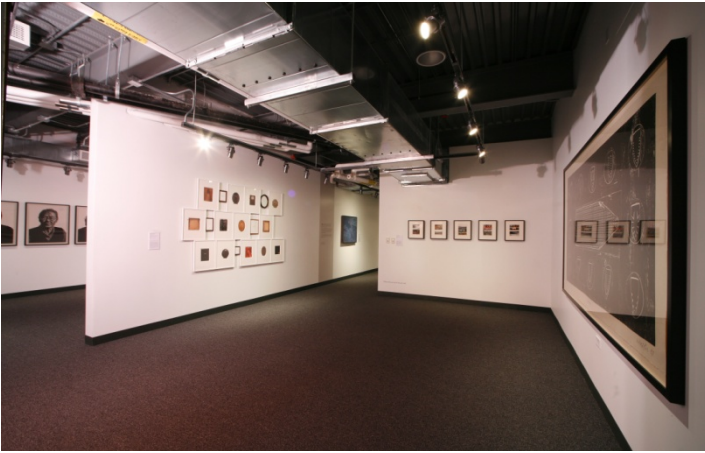
The Legacy of Absence Gallery